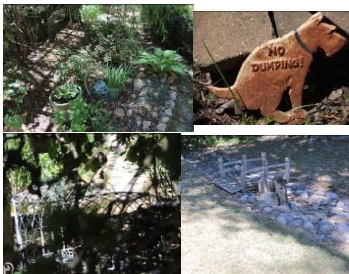
'Montmartre' (Keppel 2008)

If you have the opportunity to visit this garden you should. It is lovely mind calming garden with its hidden seats and various garden art that took some investigations to find but then there were those that were in obvious display.