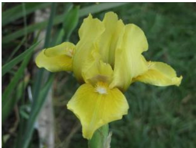
Campbell Seedling 'Sunbeams Forever'