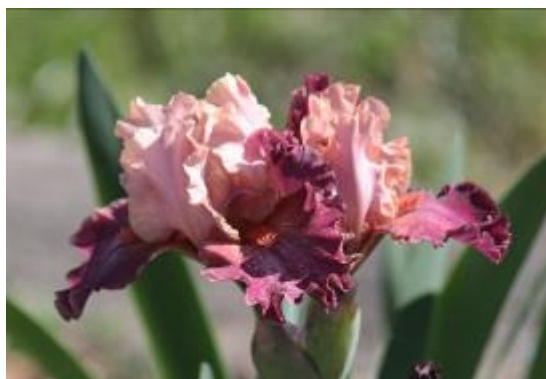
‘Calypso Heatwave’ (Black 2014),