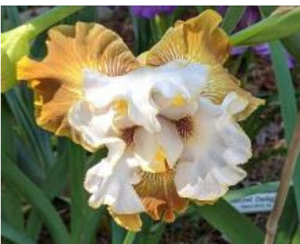
‘Copper Angel’ (Dash 2017)