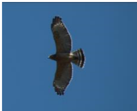
Hawk soaring above Grigg’s Garden