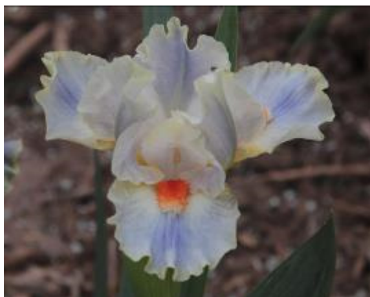
'Cher's Delight' (Paul Black 2917)