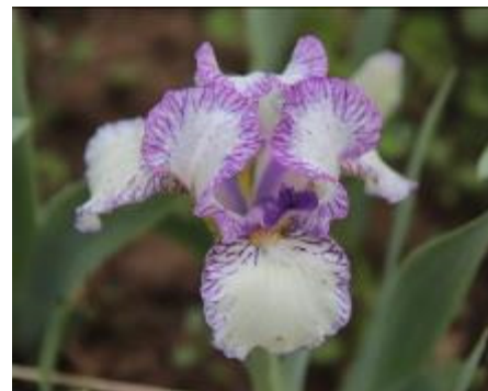
'Pixie Flirt' (Willott 1989)