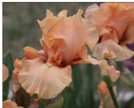
Moore 137F (Moore)