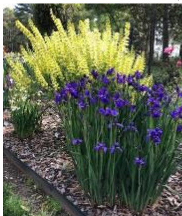
'Lemon Meringue' Baptisia With Tropic Night' SIB (Morgan 1937)