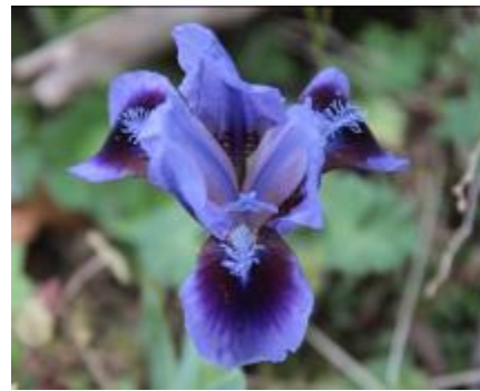
'Extra' (Palmer 1989)