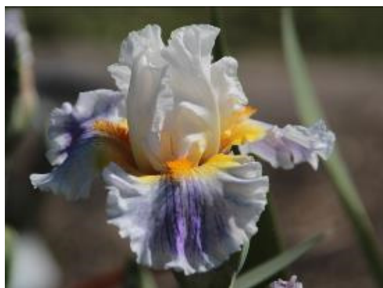
‘Painter’s Touch’ (Johnson 2017)

Among the Miniature Tall Bearded one of my favorites is the historic ‘Josephs Coat Katkamier’ (Katkamier 1930). Like many of the sport of ‘Honorable’ (Lémon 1840), its pattern of coloring can change between each flower. ‘Holiday In Mexico’ (Probst 2012), and ‘Tic Tac Toe’ (Johnson 2010) both fought off the wind to give us a great display.