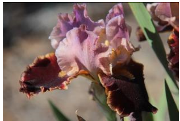
'Back By Demand' (Price 2017)