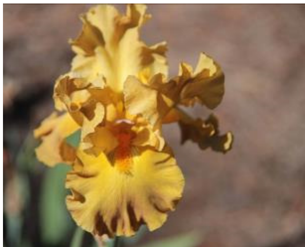
Locketell's seedling 21325

Adding variety to the viewing of the irises, other flowering plants were placed among the rows. The Miller garden was a great place to take an iris break and sit enjoying the cool of the shade and the beauty of the irises blooming.