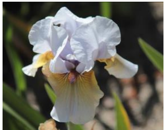
'Blackbeard's Daughter' (Crump 2009),

As we disembarked from the bus, we were treated to shade, a pleasant relief from the warm day. Within the shade were potted irises waiting for their place to be planted along with other plants waiting for the same reason. We also noted that a tree was freshly scared and although Doug Chyz would have us believe that it was due to a very large bear (at least 20 feet tall), Susan told us that the tree had been struck by lightning in a recent storm.