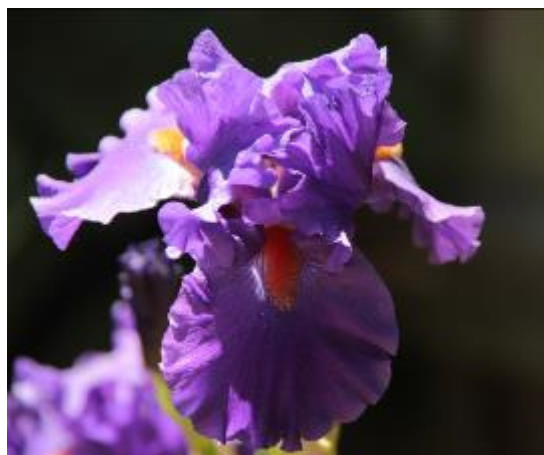
'Paul Black' (Johnson 2003),