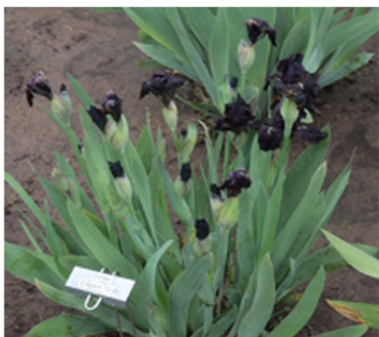
IB 'Zumba' Spoon 2013