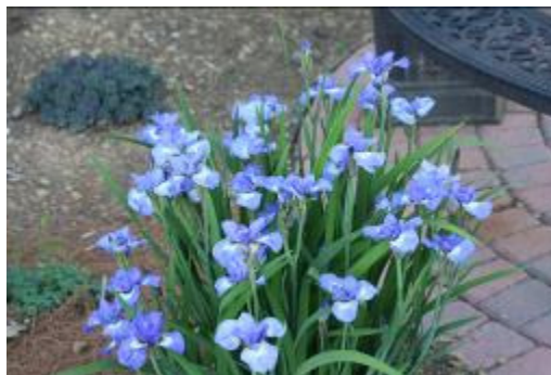
'Richard's Joyous Love' (Katharine Steel 2009)

The long, beautiful beds running along the driveway took my breath away. A huge stand of 'Wishful Thinking' (Keppel 1996), their hyacinth blue standards infused with violet purple, silvery hyacinth falls and yellow to pale lavender beards, lent a gentle contrast to nearby 'Wintry Sky' (Keppel 2002), a reverse blue amoena extending the air of casual elegance. Their cool blueness was complimented by Don Spoon's SDB 'Muppet's Sister' (2015) with its violet blue standards and falls, olive spots, and dark violet beard. Together they managed in their harmony and enchantment to subdue the otherwise orange-ruby "notice me Rock'nRoller", 'Bottle Rocket' (M. Sutton 2009).