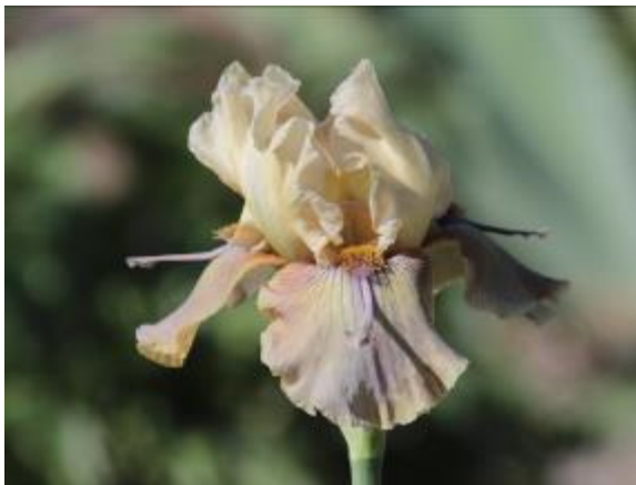
'Thornbird' (Byers 1989),