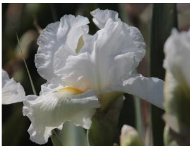
Lloyd Zurbrigg's seedling 08T2A