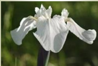
Iris setosa alba