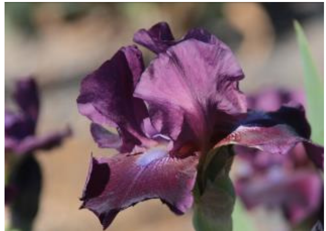
'Cobra's Eye' (D. Spoon 2000)