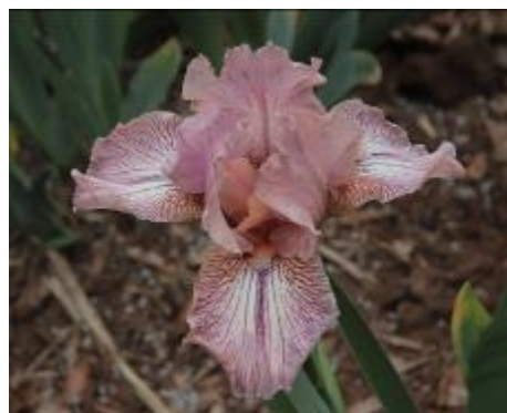
‘Pink Collage’ (Spoon 2006)

There was much to see besides the guests and I loved the ability to return to various gardens as it was desired. Having the judges training in the Stout Garden made it available even more often.