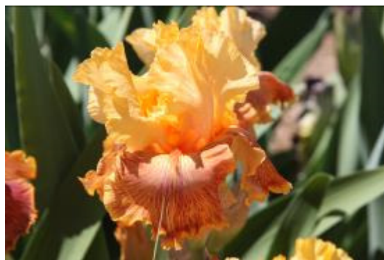
'Bottle Rocket' (M. Sutton 2009)