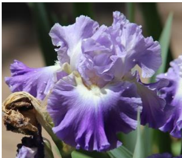
'Clarence' (Zurbrigg 1991)

Currently in the Myers' Garden there are about 400 roses, 150 irises, 150 daylilies, hostas in the shaded areas, as well as daffodils, various shrubs, and flowering trees in their garden. When you walk into the backyard, you walk into another world, a tranquil, beautiful, romantic world of irises, roses and many other flowers. The Myers started their garden from nothing but bare ground when they moved into their