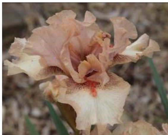
‘Ricochet Romance’ (Hill 2014)