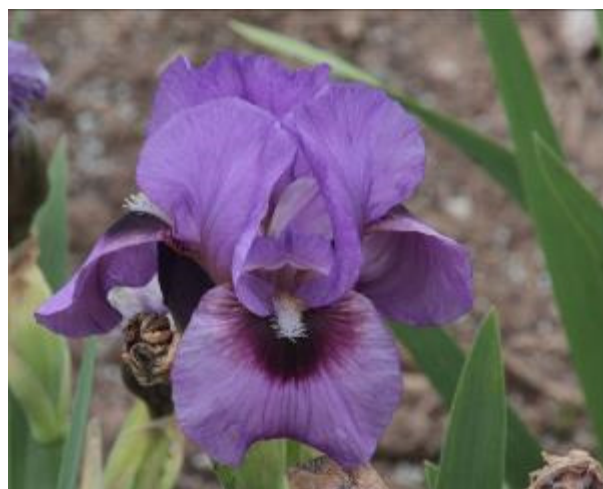
‘Signal Butte’ (Tasco 2016)