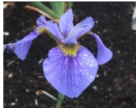
‘Happy Traveler’ (Schafer/Sacks 2015)