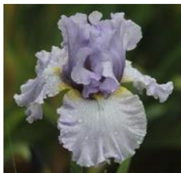
'Wishful Thinking' (Keppel 1996)