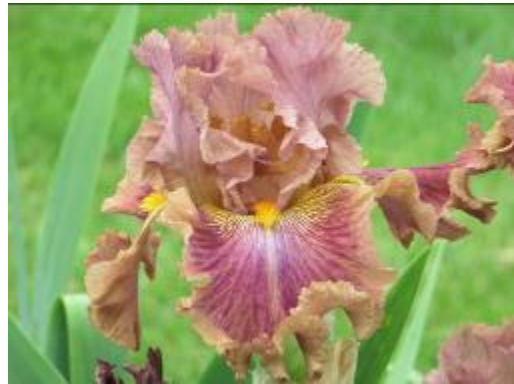
'Sugarplum Sunset' (Colin Campbell, 2021)

Moving to another portion of the seedling patch, we examined a seedling with ruffled blooms in delectable hues of rosy plum and pale cocoa. This seedling was also deemed worthy of introduction, and we set about the task of choos-