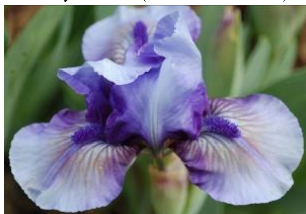
'Muppet's Sister' ( D. Spoon 2015)