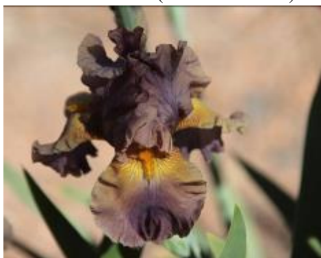
'Quik' (D. Spoon 2011)