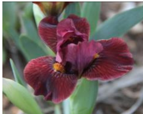
'Roman Fresco' Ginny Spoon Seedling