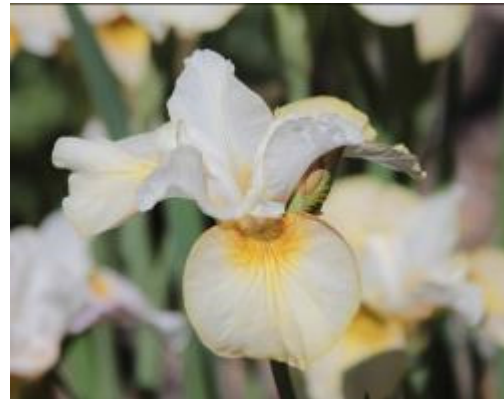
‘Crème Caramel’ SIB (Schafer/Sacks2003)