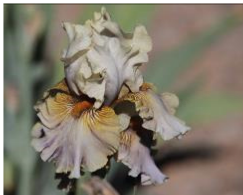
'Dugly Uckling' (Filardi 2009)