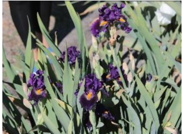
'Are You Crazy' (Black 2012)

I especially enjoyed the koi ponds and bee hives. The large koi were easy to see but difficult to count because they just wouldn't hold still. The smaller koi remained in the bottom of their tank, maybe thinking we were big bad predators. Several of the koi came to the top of the tank, even looking above the water as if asking for food or petting. I'm betting it was food they were after. They ranged in color from black to nearly all white, including some that looked like they sported armor