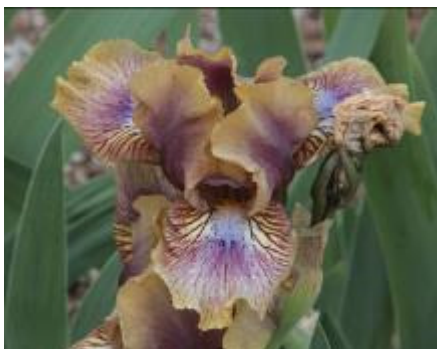
‘Kewlopolis’ (Stout 2017)