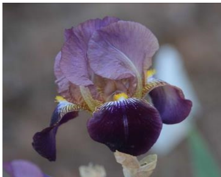
Miller MTB 'Grandpa Iris'