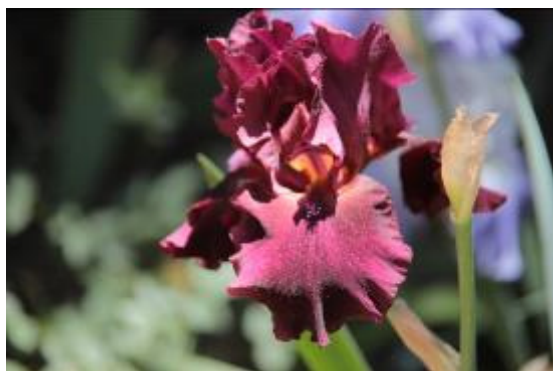
'Rio Rojo' (Schreiner 2009)