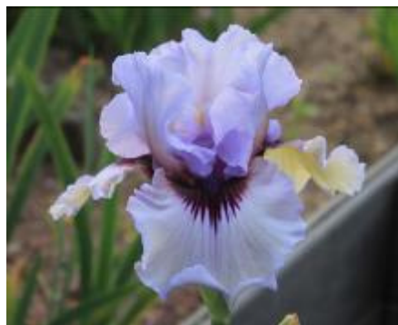
'Perry Dyer' (Paul Black 2017)