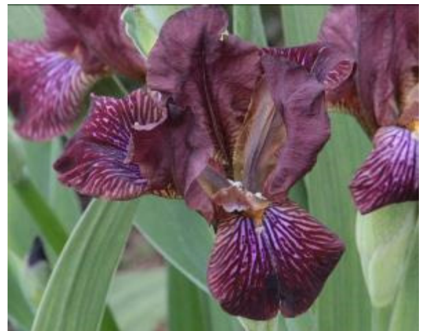
‘Black Cherry Sorbet’ (Harris 2016)