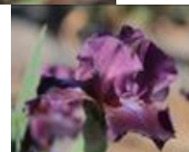
◀ 'Cobra's Eye' (D Spoon 2000)

The Nearpass Award for best Region 4 iris in Convention gardens 'Cobra's Eye' Don Spoon 2000