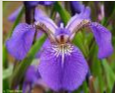
'Aaron's Blue' (Gabriel Lecomte 2018)

The plant has 3–4 flowers per stem (between 6 and 13 for the whole plant, in groups of 3, and it blooms between June and July. The large flowers are between 5–8 cm (3–6 in) across, usually 7–8 cm, and come in a range of shades of blue, which can depend on the location. and range from violet, purple-blue, violet-blue, blue, to lavender. Very occasionally, there are pink or white forms.