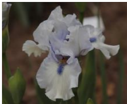
'Frosty Spirit' (Tasco 2017)