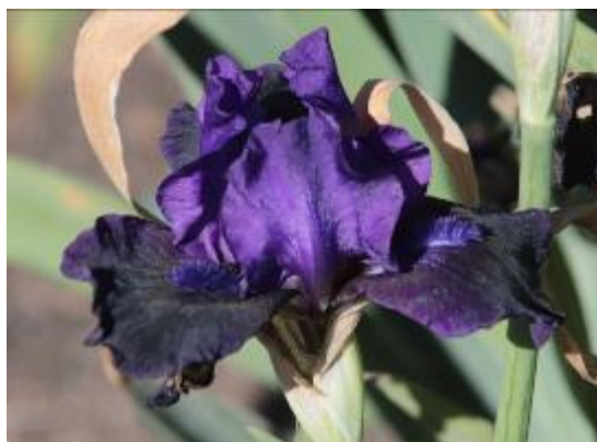
‘Dark Avenger’ (M. Sutton 2003)