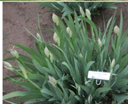
MTB 'Speckled Spring' Markham 2011