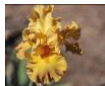
◀ Lockett Seedling 21325

The Alice Bouldin Cup, presented to a Region 4 hybridizer for the best seedling in Convention gardens Mike Lockett Seedling 21325