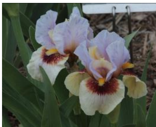
‘Pounce’ (Johnson 2018)