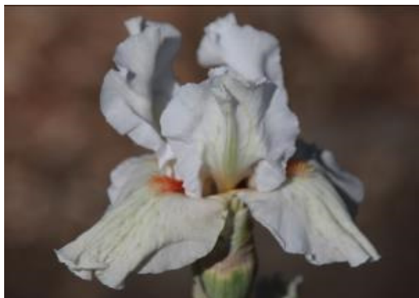
Mike Lockatell's seedling 21261