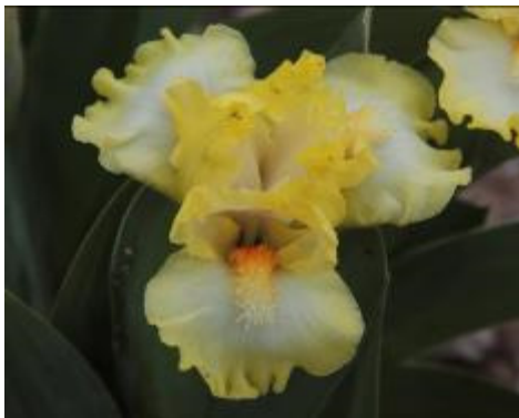
‘Blissful’ (Black 2016)