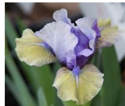
"Muppet" Spoon, R. 2010

"Muppet." A huge clump of this bright blue beauty drew exclamations in Mystic Lake Gardens. I lost count of the number of bloom stalks on a huge clump of this super performer. I added it to my garden as a result of the show it put on.