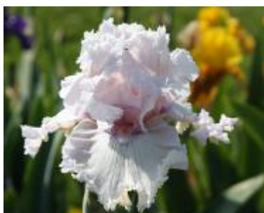
"Notta Lemon" Burseen 2010

bright gold, slight violet wash; falls bright gold heavily overlaid red violet, gold edge, gold around beard; beards gold, light gold at end." I noted a chocolate rim glittering with gold dust. Am I seeing things?