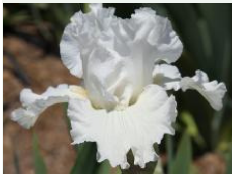
Hilton Seedling HIL00-1-3