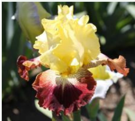
Kanarowski Seedling 0354