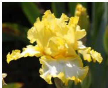
"Notta Lemon" Burseen 2010

here along with some of Tom's seedlings for region four to view.