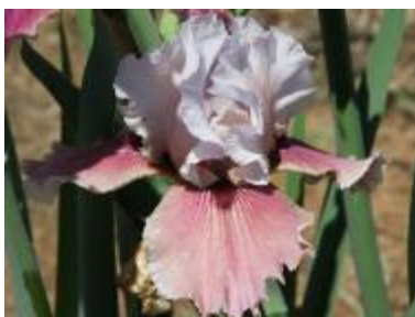
"Oh Carol" Lauer 2012

I have this lovely flower growing in two beds and given the early date of your visit to my garden you may bet to see it in bloom. I certainly hope so.