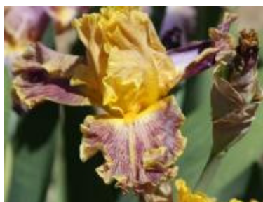
"El Greco" Burseen 2010