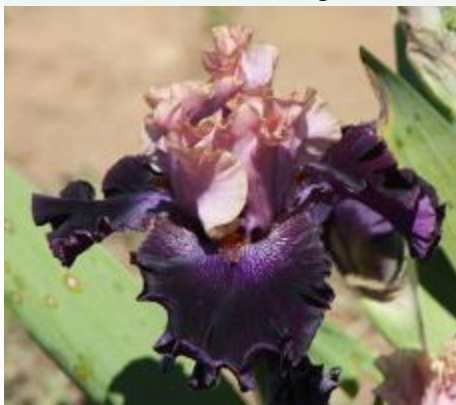
Mego Seedling AM-05-1783-1