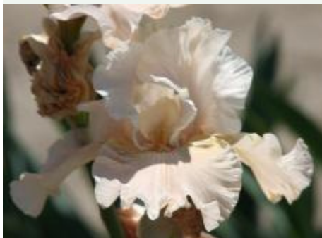
Valenzuela Seedling BB4-PL